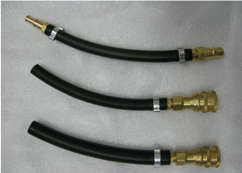
Male fitting with stepped adapter